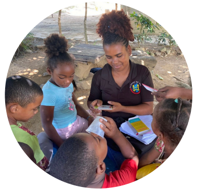
Breaking Barriers & Youth Care Center