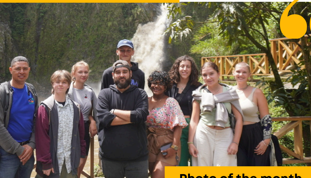
Photo of the month